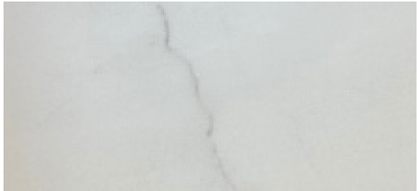
18" x 36" Honed 18" x 36", 3/8" thick COSTH1838