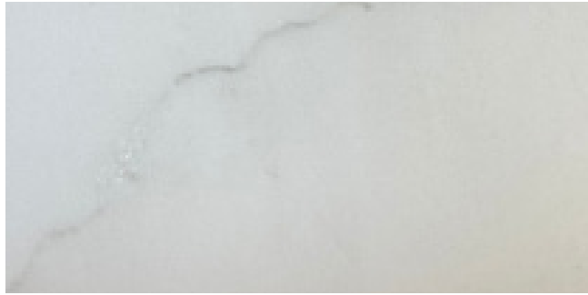
12" x 24" Honed 12" x 24", 3/8" thick COSTH1224