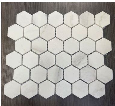
2" Hexagon Honed 12.75" x 10.75" 3/8" thick COHHEX2