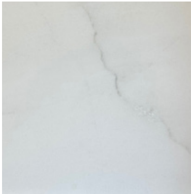
18" x 18" Honed 18" x 18", 3/8" thick COSTH18