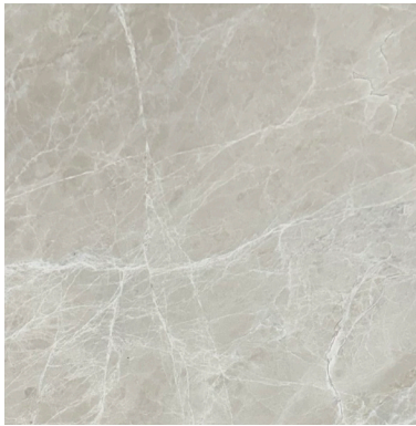
18" x 18" Honed 18" x 18", 3/8" thick VIH18