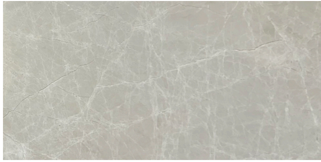
12" x 24" Honed 12" x 24", 3/8" thick VIH1224