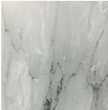
18" x 18" Honed 18" x 18", 3/8" thick COLSH18