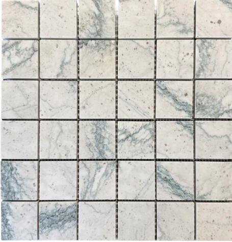
2"x2" Mosaic Honed 11mm thick CIPCH2