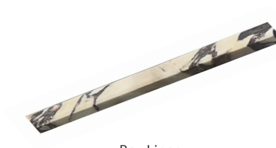
Box Liner Honed 3/4" x 12", 3/8" thick CVHBOXL