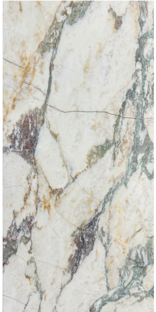
12"x24" Field Tile Honed 3/8" thick CVH1224