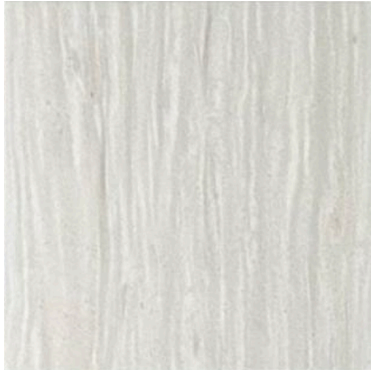
12" x 12" Honed 12" x 12", 3/8" thick NESWH12