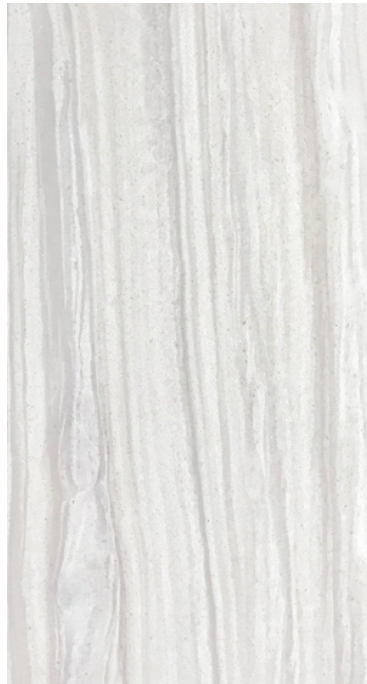
12" x 24" Honed 12" x 24", 3/8" thick NESWH1224