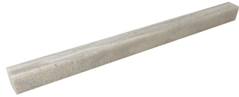
Box Liner Honed 3/4" x 12", 3/4" thick NESWHBOXL